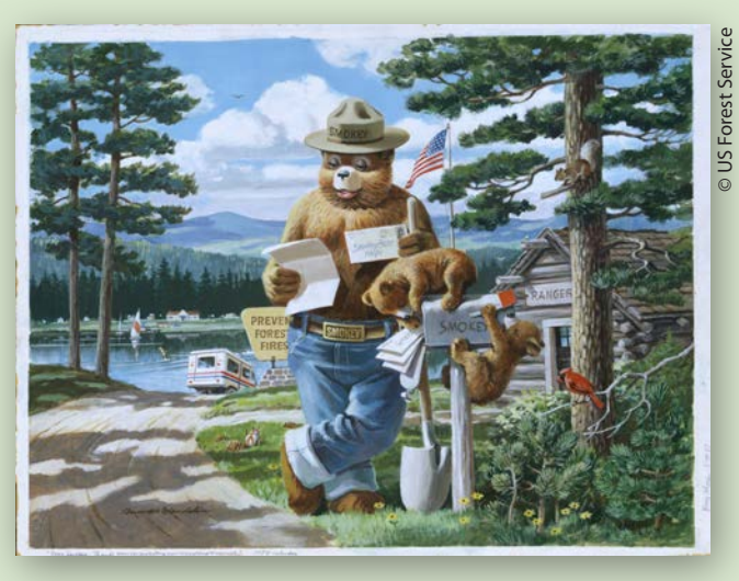
"Why the need for an image overhaul?"

Here's a sampling of the emails we received from Forest Service employees in response to those two questions: